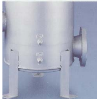
Flange fittings with legs