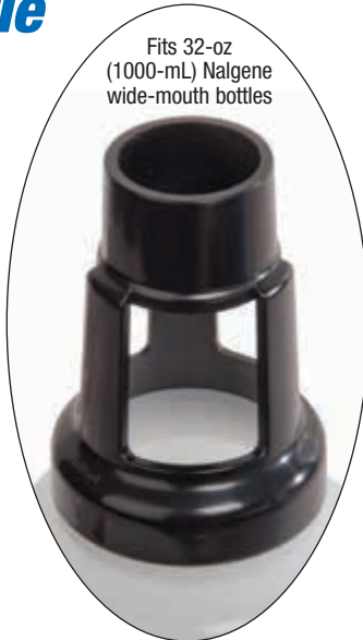
Fits 32-oz (1000-mL) Nalgene wide-mouth bottles

Convenient and easy to use, these samplers feature an ABS plastic flow-through head you attach to a wide-mouth 32-oz (1000-mL) Nalgene bottle (sold separately). No need to touch a messy bottle after wastewater collection—simply unthread the sampler by the handle (use a desired length of 1" PVC pipe). There are no complicated spring-loaded mechanisms or bottle holders that require extra handling. For distance line sampling, just clip a cord to the sampler head.