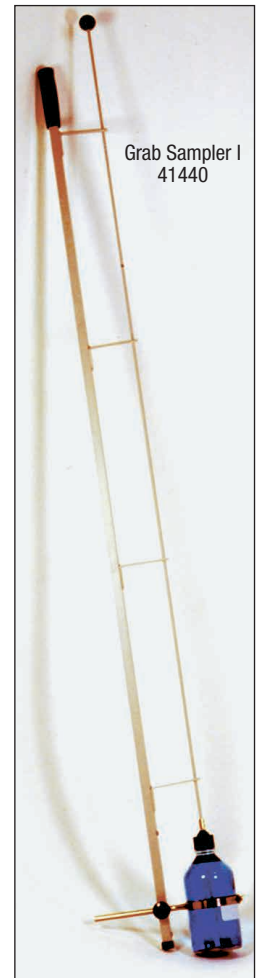
Grab Sampler I 41440