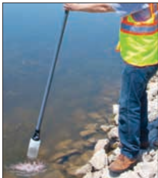
Accepts standard 1" PVC pipe as a handle...

*PVC pipe ships via UPS in two 5' sections.