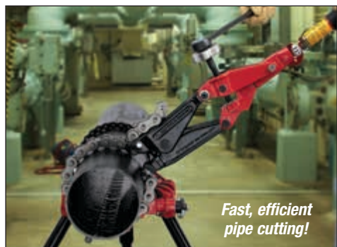
Fast, efficient pipe cutting!