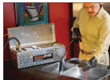
Portable jetter offers fast and easy setup.

Includes: 1/8" x 30' Super-Flex™ hose, four-piece nozzle set (including penetrating nozzles with and without forward jet, flushing nozzle, and spring leader nozzle), water supply hose, shut-off valve, universal faucet adapter, threaded faucet adapter and rubber gloves.