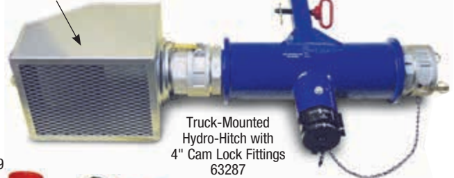
Truck-Mounted Hydro-Hitch with 4" Cam Lock Fittings 63287