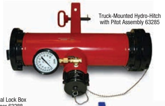
Truck-Mounted Hydro-Hitch with Pitot Assembly 63285