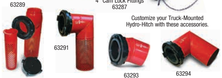
Customize your Truck-Mounted Hydro-Hitch with these accessories.

We also offer hydrant-mounted steamer port diffusers. The unique perforated design has a spray pattern that will not erode lawns and keeps you dry while the hydrant is opened. Choose from several connection sizes.