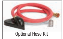
Optional Hose Kit