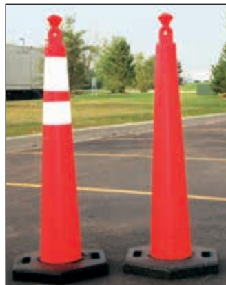
Reflective Cone Plain Cone

Shipping: Additional shipping fees apply. Quantities of 11+ ship motor freight.