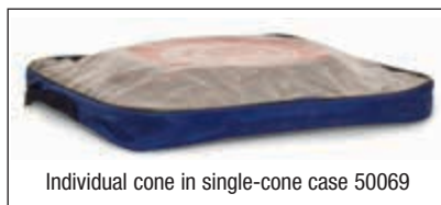
Individual cone in single-cone case 50069

Cones are easy to transport in their convenient carrying cases. Choose from individual cones in a single-cone case, or a pack of five cones in a five-cone case. Meet MUTCD standards for traffic safety cones.