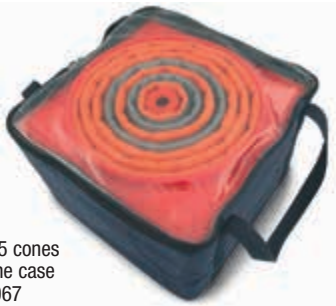
Pack of 5 cones in 5-cone case 50067