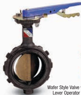
Wafer Style Valve w/ Lever Operator

Note: Larger sizes and alternative materials of construction are available. Contact USABlueBook for more information.