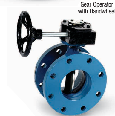
Gear Operator with Handwheel