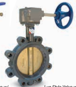
Lug Style Valve w/ Gear Operator