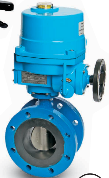
Electrically Actuated Valve