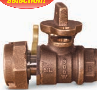
Straight Valve with Meter Swivel Nut 31655