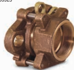
Telescoping Flange Only 31653