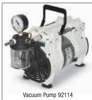
Vacuum Pump 92114

Alternate voltages are available. Contact USABlueBook for more information.